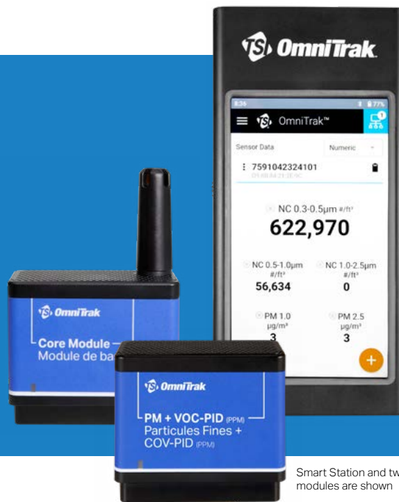
Smart Station and two modules are shown