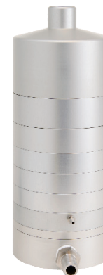
Figure 4: 131B High-Flow Cascade Impactor.

Refer to Table 2 and/or Figure 5 when selecting an impactor model. Please feel free to contact TSI® for support in selecting the impactor that is right for your needs.