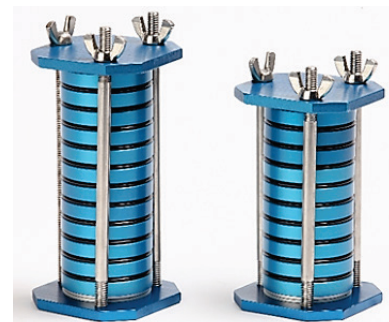
Figure 6: Spare Sets of Impaction Plates

It can be convenient to have a second set of impaction plates. This allows you to bring a new set of substrates to an impactor that is currently sampling, perform an exchange, and carry your samples – protected – back for analysis. Spare sets as shown in Figure 6 are available for several MOUDI™ Impactors, as listed in Table 4.