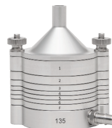
Figure 2: 135-6B Mini MOUDI™ Impactor

The Mini MOUDI™ impactors are ideal for personal sampling. They have a design flow rate of 2 L/min, which is supplied by a pump that can be worn by the user. The three models of Mini MOUDI™ impactors have three different smallest cutpoints; users can go down to 0.56 µm, 0.18 µm, or 0.056 µm. Figure 2 shows the six-stage 135-6 Mini MOUDI™ impactor with the cowl inlet. This inlet is ideal for personal sampling; see the footnotes of Table 2 for more information on the available inlets for Mini MOUDI™ impactors.