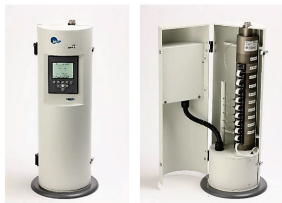
Figure 3: 120R Nano MOUDI™ impactor: exterior (left) and interior (right)

The impaction stages of the Nano MOUDI™ impactors rotate during sampling. This rotation results in the sampled particles being deposited over a wider area on the substrate, relative to non-rotating impactors.