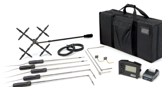
Model 8715 - shown with standard and optional accessories