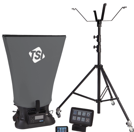
Model 8380 - shown with standard and optional accessories