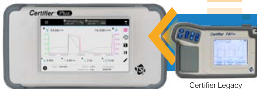
Certifier Legacy 4080 FA+ Certifiers not shown at scale