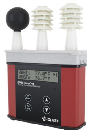
Figure 2: QUESTemp° 46

In Table 1 and Table 2, a Combined data set is listed in the Data Set column. In Table 1, the Combined data set consists of the data from the Laboratory, Outdoor, and No Air Flow data collections. In Table 2, the Combined data set consists of the data from the Laboratory and Outdoor conditions.