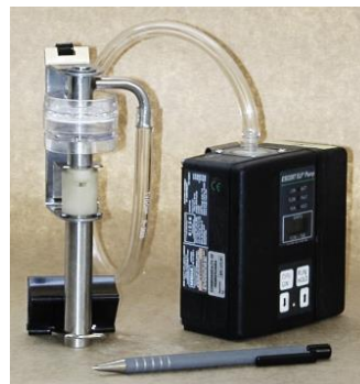
Sample Pump with Respirable Silica Sampling Train