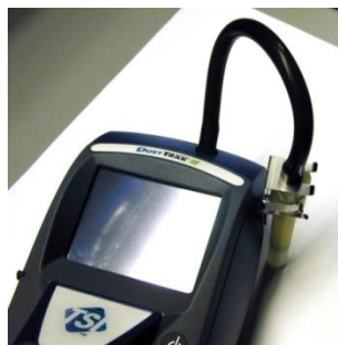
TSI® Handheld DustTrak™ II with Dorr-Oliver® Respirable Cyclone