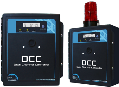
DCC shown with Option L

The DCC Dual Channel Controller is a comprehensive and dependable, self-contained system that offers one or two channel configurations for monitoring toxic and combustible gases with straight-forward control functionality for non-hazardous, non-explosion rated, commercial and light industrial applications.