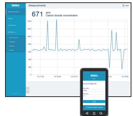
Wireless configuration interface example (desktop and mobile views)

For more information on Indigo transmitters and the Indigo product family, see www.vaisala.com/indigo .