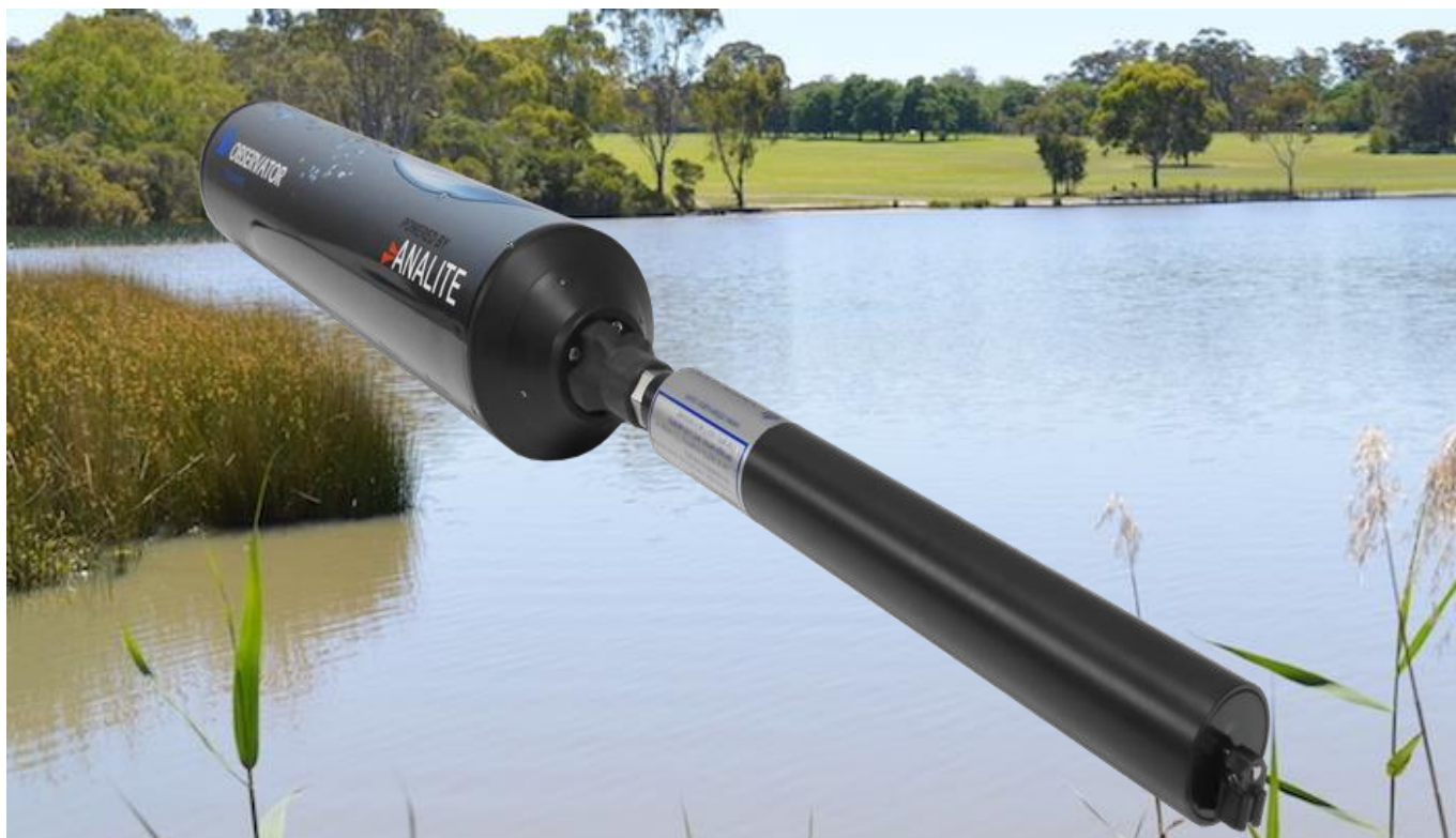
Suitable for long-term turbidity & temperature monitoring & logging