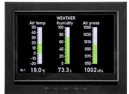
XDi 192 N