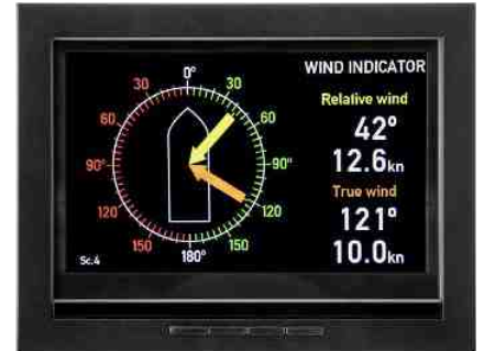
XDi 192 N