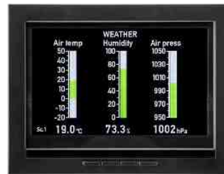
XDi 144 N