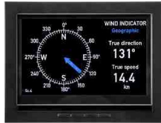
XDi 144 N

XDi-N Wind/Weather Repeater Input: XDi-net No NX2 I/O module required.