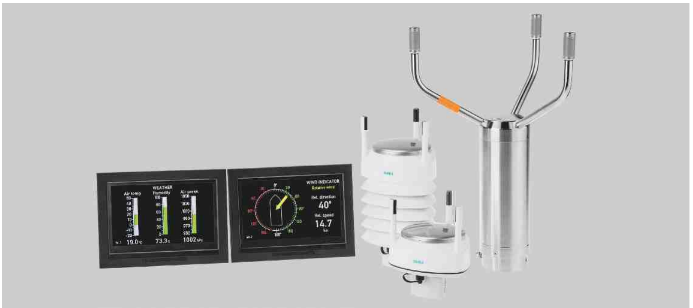
Wind and Weather Measuring Solutions for Marine Applications

DISPLAYS, ULTRASONIC WIND SENSORS AND WEATHER TRANSMITTER