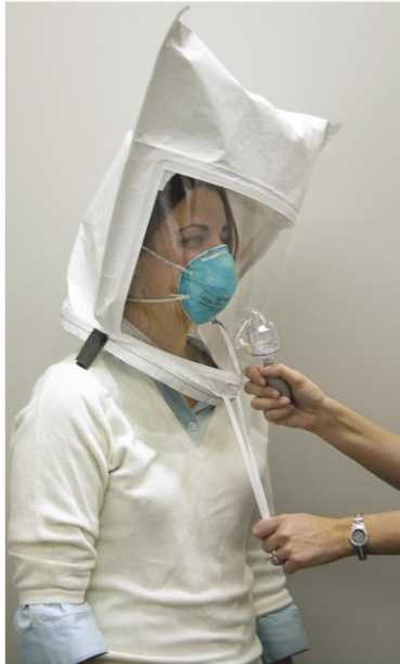
Qualitative fit-test in progress.

Qualitative fit-testing (QLFT) is a subjective pass/fail test that involves exposing the respirator wearer to a chemical stimulant that can only be detected if the respirator leaks unacceptably. If the person says that the chemical is detected, the leakage is too high and the fit is not acceptable (fail). When the chemical is not detected, the person is deemed to have an acceptable fit (pass).