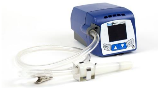
TSI AM520/AM520i Personal Aerosol Monitor and Dorr-Oliver Cyclone