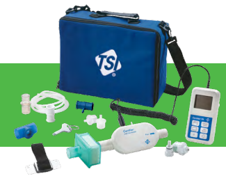
4070 High-flow test system with 4073 Oxygen sensor kit (sold separately)

TSI and the TSI Logo are registered trademarks of TSI Incorporated.