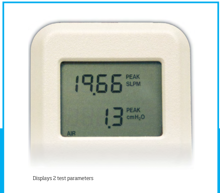
Displays 2 test parameters