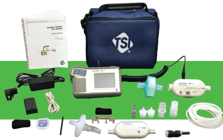
4080 High-flow test system with 4082 Low-flow kit (sold separately)