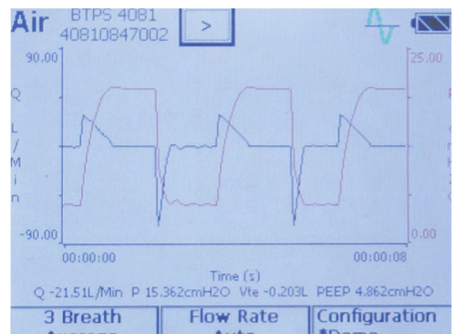
Graph up to 2 test parameters