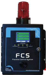
FCS shown with Options DL, L and SW