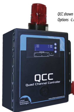
QCC shown with Options -L and -SW.