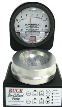
Calibration Head Attached to Pump

*Depends on battery maintenance, backpressure, etc.