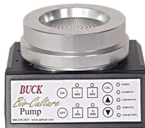
Model B30120 30-120 LPM Programmed Sampling for Bio-contaminants Sampling

The front key pad is organized into three functional key groups: Power (ON-OFF), Timing (1, 2, 5, 10 minute samples), and Calibration (Cal mode, Increase flow, Decrease flow). Positive tactile feedback is provided by the keys. The BUCK Bio-Culture™ Pump has internal NiCad batteries to provide a full six hours continuous run time at 100LPM. The standard charger provides a battery recharge in 12-16 hours and allows the unit to operate on AC power; the optional FastOne™ Charger provides a battery recharge in one hour. End of sample notice is provided by the lit LED "Complete" and three short beeps.