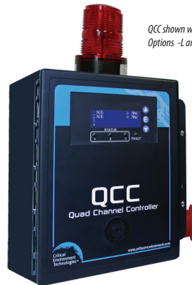
QCC shown with Options -L and -SW.