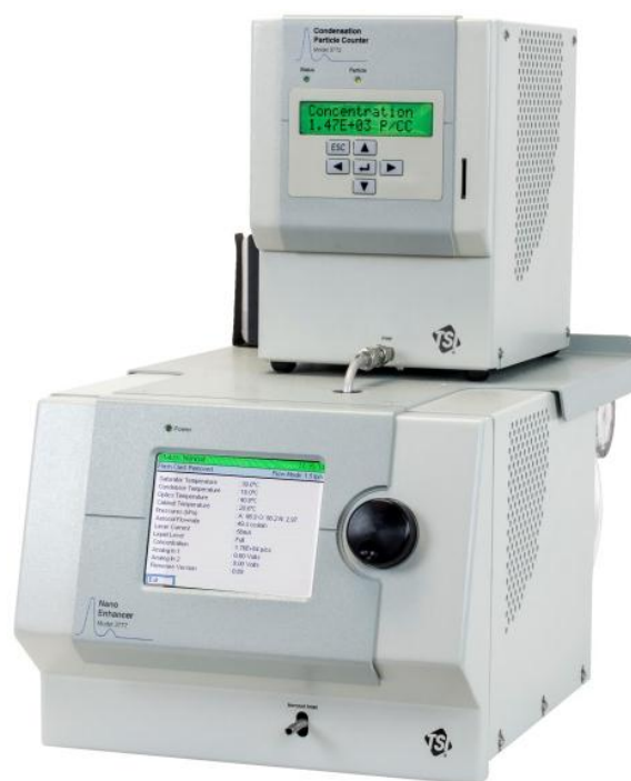
Figure 3: 1nm CPC system consisting of a Model 3777 Nano Enhancer coupled to a Model 3772 CPC

For complete specifications on the Model 3777 Nano Enhancer, 1nm-DMA, and 1nm SMPS system see the 1nm specification sheet on www.tsi.com .