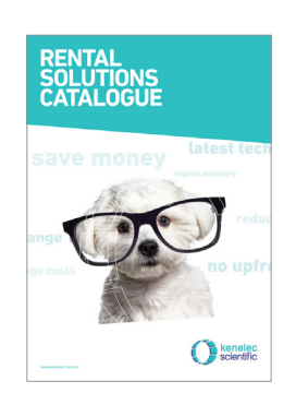
Rental Solutions Catalogue