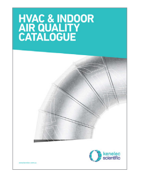
HVAC & Indoor Air Quality Catalogue