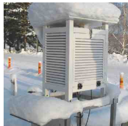
Figure 2: Two HUMICAP® instruments were mounted inside a Stevenson screen on the Vaisala test grounds in Vantaa, Finland. Sensor purge was also used.