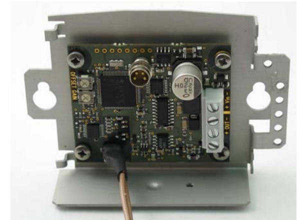
Figure 2 Module Mounted in the Bracket