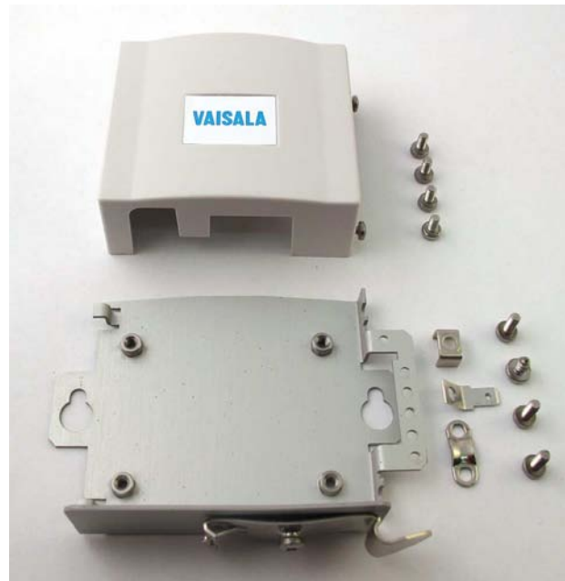
Figure 1 Mounting Bracket Parts