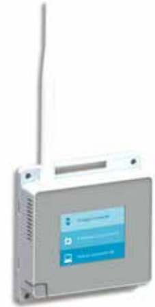
VaiNet access points allow users to collect live data from up to 32 data loggers.

The Vaisala viewLinc Monitoring System tracks environmental conditions wirelessly using Vaisala's VaiNet wireless devices based on LoRa®* technology. By using a modified chirp spread spectrum (CSS)* signal modulation, VaiNet provides robust communication that is extremely reliable over long distances and under harsh, complex and obstructed conditions. Long-range wireless communication eliminates the need for repeaters to boost signal strength. VaiNet's wireless data loggers and access points are pre-programmed to locate each other and establish communication. Less equipment and less configuration simplifies installation so users can deploy with little or no previous experience setting up networked monitoring systems.