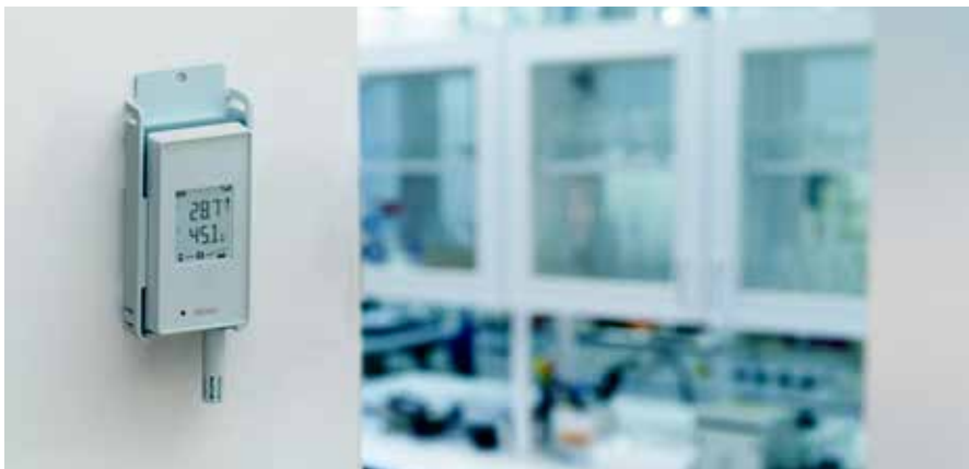
Vaisala VaiNet Temperature and Humidity Data Logger RFL series

The Vaisala VaiNet Wireless technology uses sub-GHz frequencies to provide better signal propagation in environmental monitoring applications. Most industrial monitoring systems equipped with wireless devices use some sort of redundancy to protect against any single point of failure in a network of data loggers. VaiNet creates redundancy by distributing the signal load across several network access points. The wireless signal strength between access points and data loggers determines the optimum data path. Access points use Power over Ethernet (PoE) to reduce cabling and allow easy connection to a UPS*. A separate power supply is provided for installations where PoE is not available. Additionally, each RFL series data logger is fully wireless, powered by batteries to ensure that the system continues monitoring during power outages. Each logger can maintain up to thirty days of data if the wireless network loses connectivity, and the access points provide additional data storage should the Ethernet LAN fail. As soon as the network is restored, data loggers and access points automatically backfill all historical data to the monitoring system software to ensure gap-free historical records.