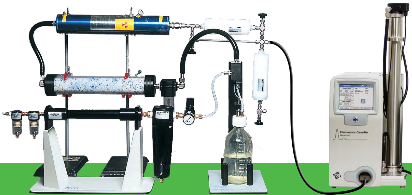
This Model 3940A system is shown ready to calibrate a TSI Model 3082 Electrostatic Classifier. Ask your TSI representative about additional components needed for your particular application.

The standard Model 3940A system uses two neutralizers to ensure that particle charge is fully reduced to a Fuch's equilibrium before aerosol enters the DMA. By itself, the 3077A may not be adequate if the high-concentration aerosol generated by the atomizer is also highly charged.