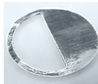
Figure 2. Impaction substrate