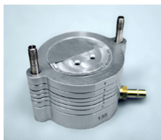
Figure 1. Stage body design

The stages are designed to prevent cross-flow interference between adjacent nozzles. The result is sharp cut-size characteristics not available with other cascade impactors that are less well designed aerodynamically (Figure 3).