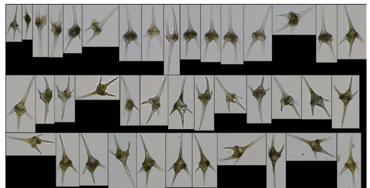
Figure 1. Ceratium images captured with FlowCam 8400 in Trigger mode using a 10X objective, as displayed in VisualSpreadsheet

The unique and uniform mantra is illustrated with Ceratium and Chaetoceros , a common marine diatom (Figures 1 and 2, respectively).