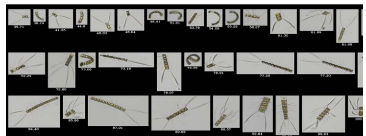
Figure 2. Chaetoceros images captured with FlowCam 8100 using a 4X objective, as displayed in VisualSpreadsheet