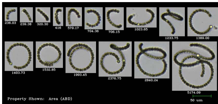
Figure 3. VisualSpreadsheet images of Dolichospermum . The Area (ABD) of the whole filamentous algae ( \mu\text{m}^2 ) is noted beneath each image. A selection of these images were used to calculate the average Area (ABD) of a single cell.

Using a selection of images from the VisualSpreadsheet file (Fig. 3), the average Area (ABD) of a Dolichospermum cell was determined to be 48 \mu\text{m}^2 .