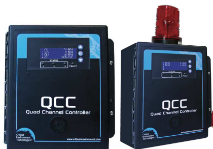
QCC shown with Options L and SW

The QCC Quad Channel Controller offers four channel configurations for monitoring toxic, combustible and/or refrigerant gases with versatile control functionality for non-hazardous, non-explosion rated, commercial and light industrial applications. It is designed to accept inputs from up to four remote digital and/or analog transmitters using digital or 4-20 mA analog input. The QCC is available in two models, the QCC-M with Modbus® RTU RS-485 output or the QCC-B with BACnet® MS/TP RS-485 output for communicating with a Building Automation System (BAS).