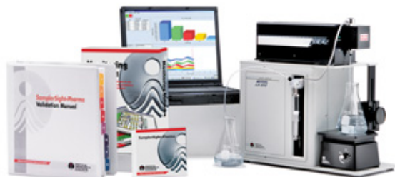
Figure 1 APSS 200 Sampler System with Validatin Documentation

measurements of 50 \mu\text{m} or larger can be detected by visual inspection. To detect particles less than 50 \mu\text{m} an APSS 200 particle counting system is recommended. International limits apply to the number of particles which can be present in parenteral formulations (USP Test Section <788>).