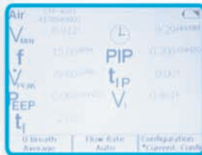
Displays up to 18 test parameters