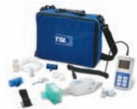
4070 High-flow test system including the 4073 Oxygen sensor kit

TSI Incorporated — 500 Cardigan Road, Shoreview, MN 55126-3996 USA