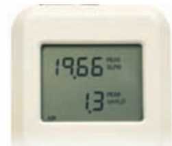
Displays 2 test parameters