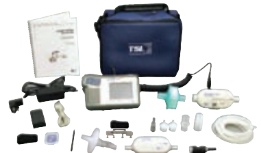
4080 High-flow test system including the 4082 Low-flow kit