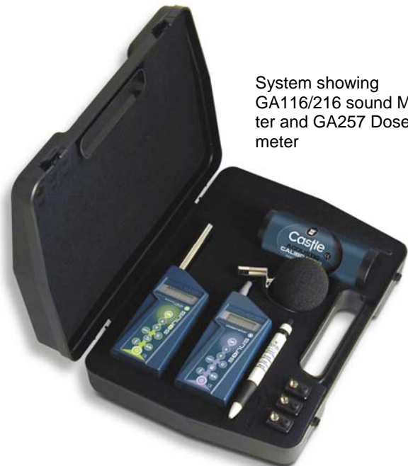
System showing GA116/216 sound Meter and GA257 Dosemeter