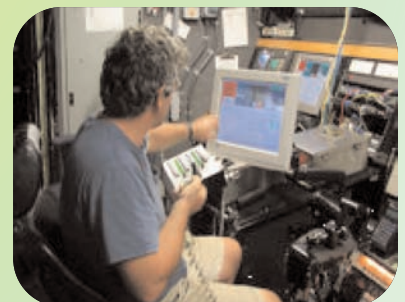
Water Quality Meters

Australia's Leading Calibration Laboratories for HVAC & Environmental Products