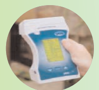
Gas Monitors & Sensors