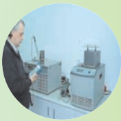
Temperature & Humidity