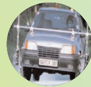
Laser Speed Gauges