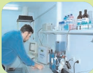
Liquid Particle Counters