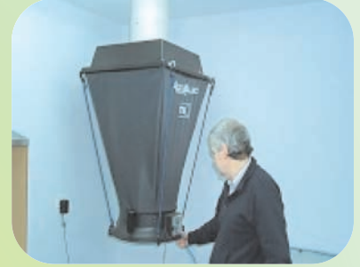
Air Balancing Hoods