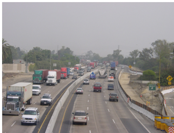
Measuring aerosol inside the traffic flow creates new challenges and insights.

Every day, hundreds of thousands of Los Angelinos spend an estimated 1½ hours commuting to and from work, with much of this time spent on freeways. They share the road with diesel trucks, buses, and a great many cars. Investigators from the California State Air Resources Board, the University of Southern California's Aerosol Science Laboratory, and the Southern California Particulate Matter Supersite and Center assembled a mobile air-monitoring platform to collect particle count and concentration data inside this challenging environment. The platform was capable of supporting and operating an array of state-of-the-art particle monitors.