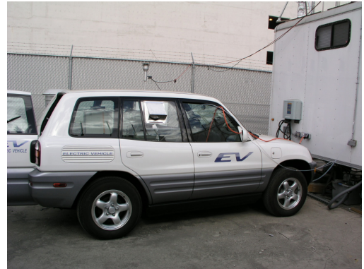
The mobile air-monitoring platform used by California researchers to monitor inside freeway traffic was installed in a Toyota RAV4 electric vehicle. This mobile laboratory provided exciting new data about aerosols in and around high-traffic areas.

The Los Angeles study found a surprisingly dynamic range of pollutant levels, with very great differences between on-road concentrations and those in communities no more than ¼ mile from the freeway edge. Several of the particulate phase pollutants track closely together, because they originate from the same traffic sources. A unique and challenging facet of this work was to determine the size distribution of ultrafine PM in these microenvironments. The SMPS systems were operated in a synchronized 60-second scan mode in hopes that they might capture the complexity of sources and operation conditions encountered. The researchers reported that indeed they were able to assemble robust, continuous size distributions over the size range of 6 to 600 nm. They also reported that ultrafine counts in excess of 4 million particles per cc were encountered during their studies. Counts on freeways are more typically in the range of 100,000 to 500,000 particles/cm 3 . Exposure while driving in these highly polluted microenvironments may dominate daily levels for the driving population.