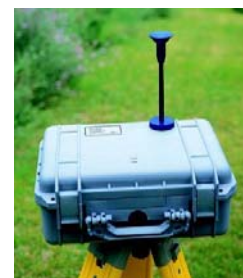
Environmental Enclosure in-use

Sub-isokinetic sampling takes place when ambient wind speed is greater than the sampling velocity found at the inlet point of the aerosol sampler. This creates a high-pressure area in front of the inlet and causes the flow streamlines to diverge around it. Extremely small particles (less than 1.0 micron) have low momentum and follow the streamlines. Larger particles that have more momentum will have a tendency to remain traveling in the same direction and enter the sampler rather than follow the streamline around it. This can cause the larger particles to be artificially sampled, resulting in a mass concentration reading that is higher than the true value.