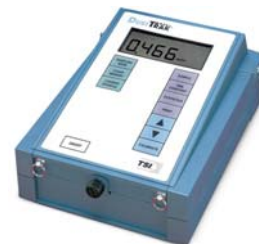
DustTrak Model 8520

The Model 8520-1 DustTrak Environmental Enclosure utilizes an external omnidirectional aerosol inlet to collect and direct particles into the TSI Model 8520 DustTrak Aerosol Monitor. The design of the inlet maximizes the aspiration efficiency of aerosol particles in wind conditions ranging from calm air to wind speeds of 22 mph.