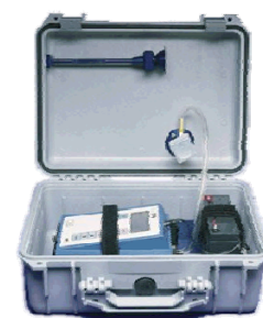
Environmental Enclosure Model 8520-1 with inlet assembly stored

Aspiration efficiency is defined as the fraction of particles that are sampled, compared to the total number of particles actually present in the air. An aspiration efficiency of 1.0 means that all particles are sampled. Aspiration efficiency is size dependent. The larger the particle, the more likely it is to escape sampling because momentum effects prevent it from following the flow streams. Smaller particles follow the flow stream more easily, and are sampled with higher efficiency.